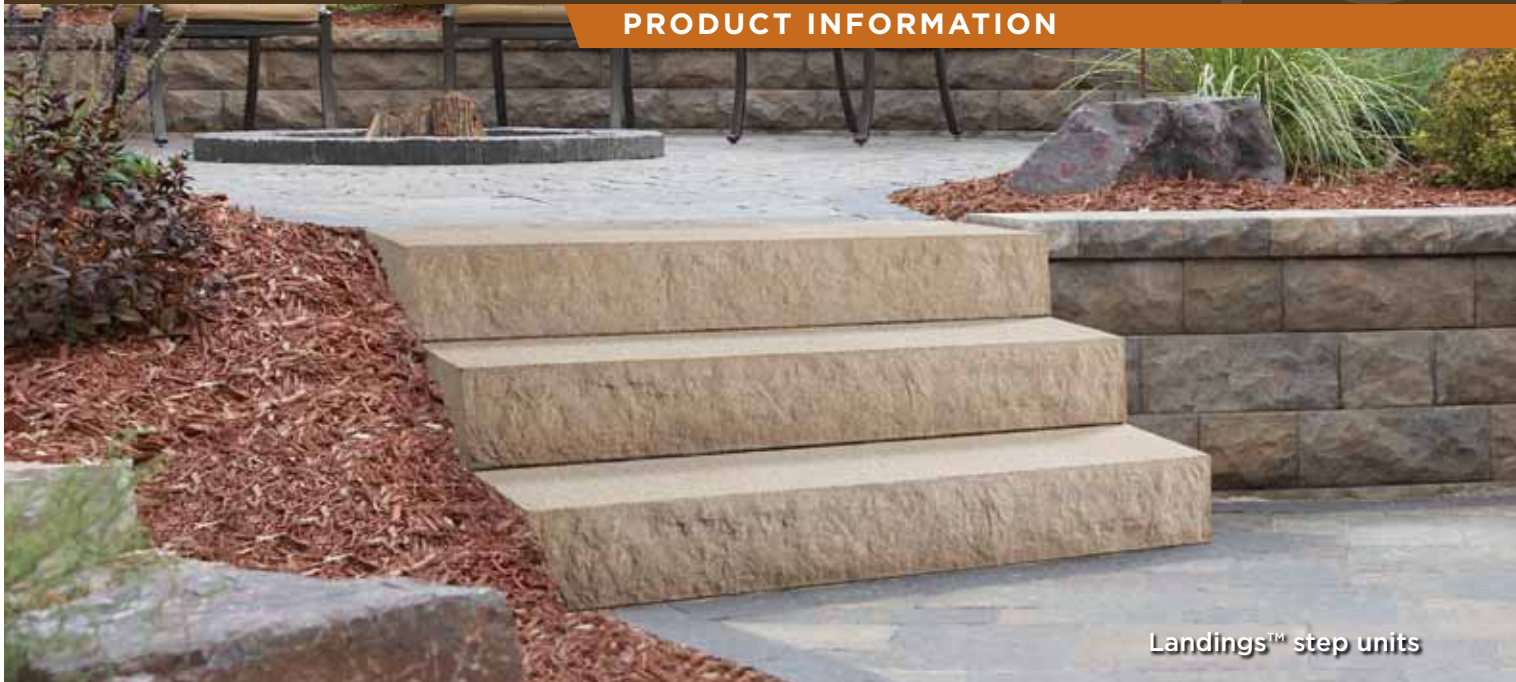
Landings ™ step units

The Landings ™ step unit adds grand style to entrances and stairways with its quarried limestone look. Integrate into landscape projects or use as a standalone feature.