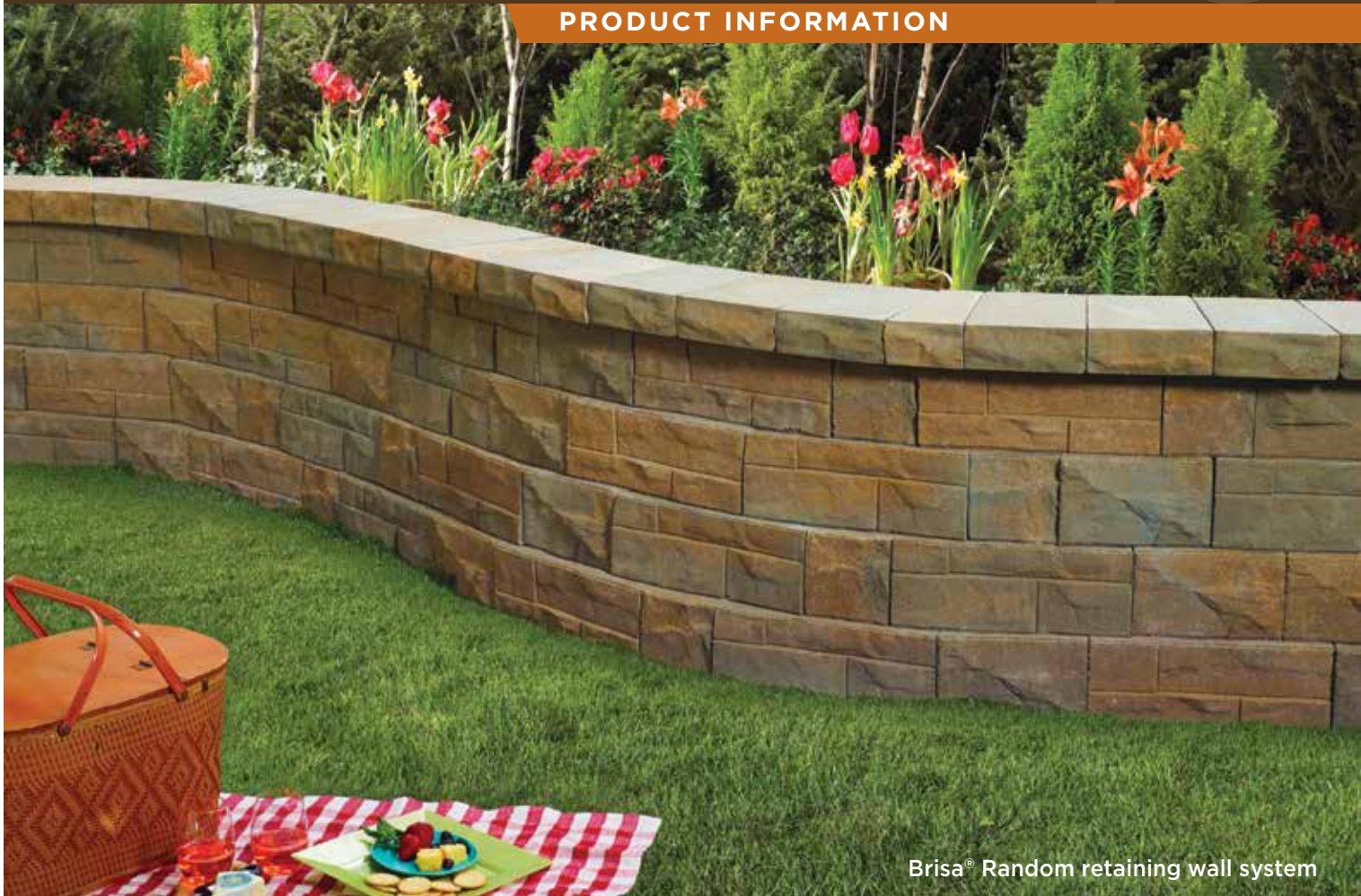
Brisa ® Random retaining wall system

Get the look of split limestone with the Brisa ® Random wall systems. The retaining wall system offers a multi-height appearance with the installation speed of a single-height system as well as design flexibility. Complementary accessories and freestanding wall products complete the system.