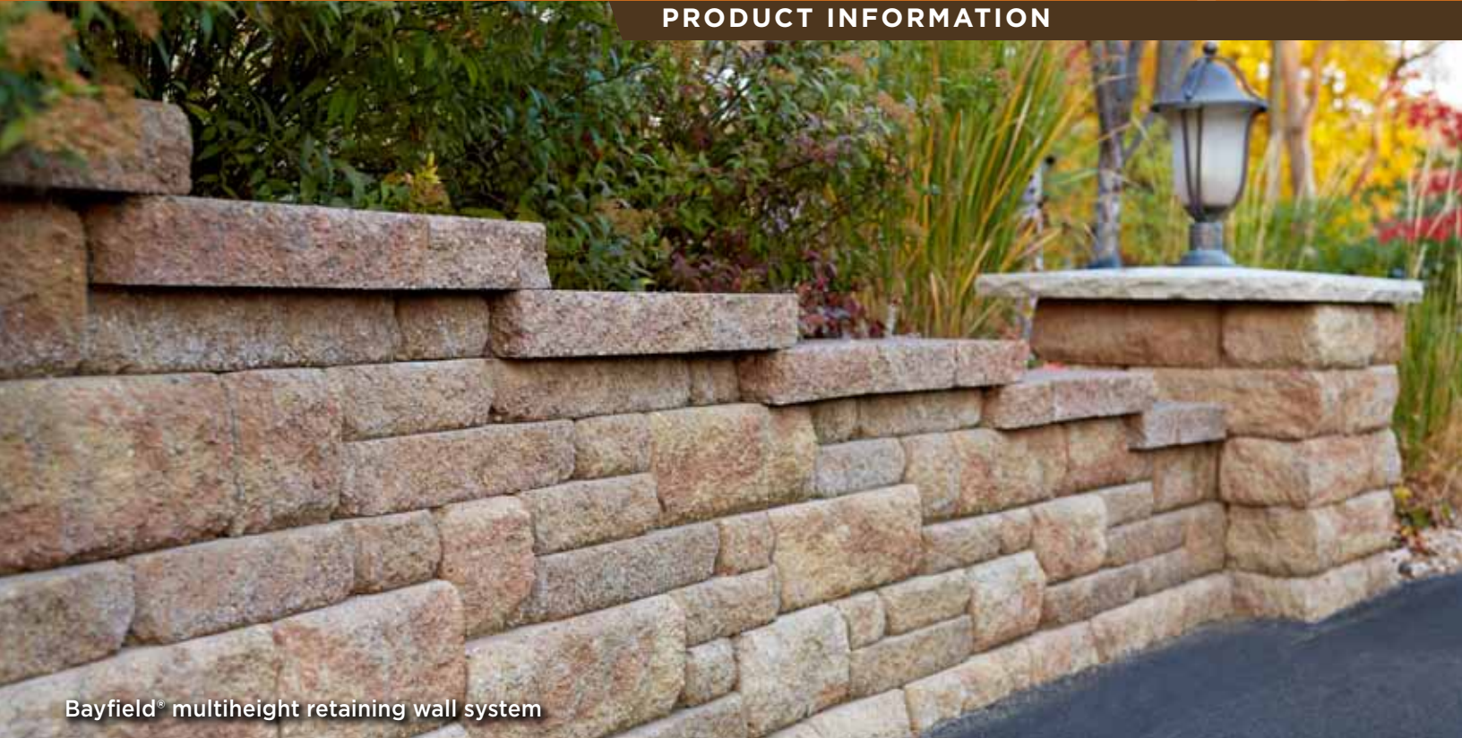
Bayfield® multiheight retaining wall system