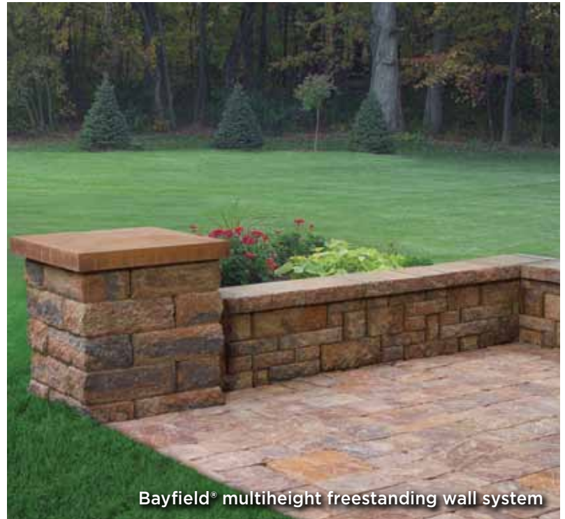
Bayfield® multiheight freestanding wall system