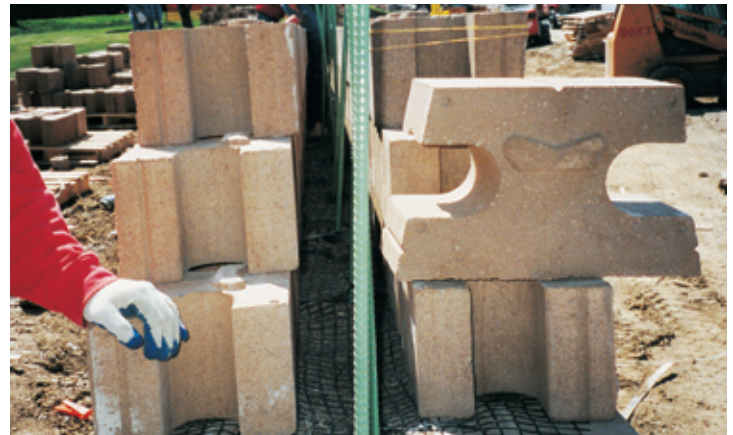
Vertica® retaining wall system blocks in the barrier wall were tied together with geogrid reinforcement.