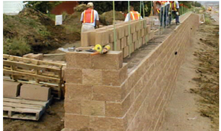
The geotechnical engineer specified gravel fill rather than concrete for this barrier wall made of back-to-back modular units so that it could be more easily repaired in the event of an accident.