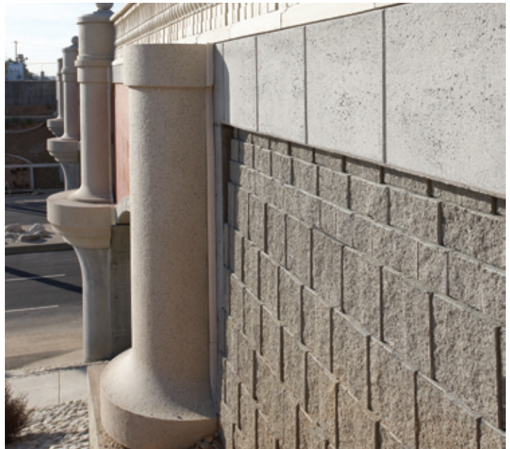
The four Landmark retaining walls flank each corner of the bridge and support full Cooper E-80 loads.