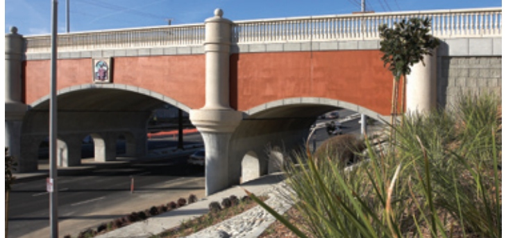
The award-winning design separates auto and train traffic to improve traffic flow and safety.