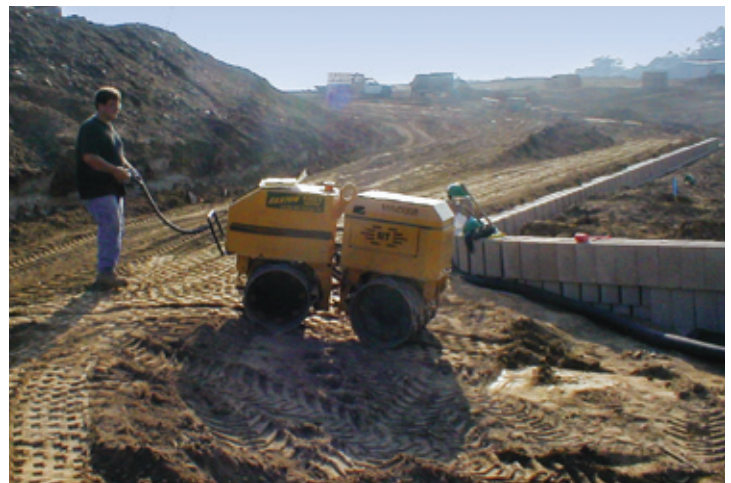
Reinforced soils were placed in loose lifts of 6 to 8 inches and compacted with remote-controlled equipment.

For high performance under extreme loading conditions, the Landmark retaining wall system is a cost-effective option evaluated by HITEC. The Landmark system features a unique mechanical connection, which allows the system to generate extremely high connection values, independent of blocks above the connection. Developed specifically to meet the high standards of the transportation industry, the performance features of the Landmark system make cost-effective design solutions possible using either the American Association of State Highway and Transportation Officials (AASHTO) or the National Concrete Masonry Association (NCMA) design methodology.