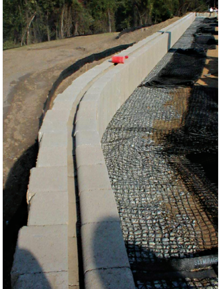
Landmark units curved for visual appeal. Geosynthetic reinforcement is held in place with the patented mechanical connection.

Local officials went from skeptics to supporters of the Landmark system based on the aesthetics and performance of the extensive project. The developer was able to improve project finances with the additional lots.