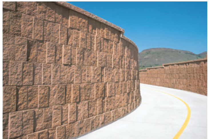
The buff colors blend into the surrounding landscape.