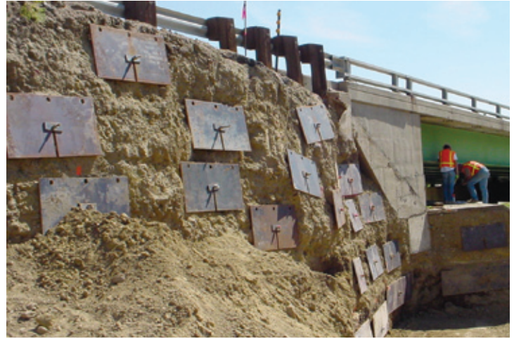
Nearly 30 percent of the project was installed using direct anchorage, which made it possible to install the Landmark retaining wall system without closing adjacent roadways.

Jefferson County has an attractive, affordable addition to the 179-mile trail program they supervise, providing increased access to the Open Spaces where the mountains and plains meet. Using the Landmark system, the trail was built across a wide range of sites without disturbing trees and vegetation or closing adjacent roadways.