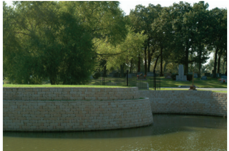
The blended color of the rough, rock-like texture of the multipiece system helped the product fit with the rustic granite shore walls that remained in place.