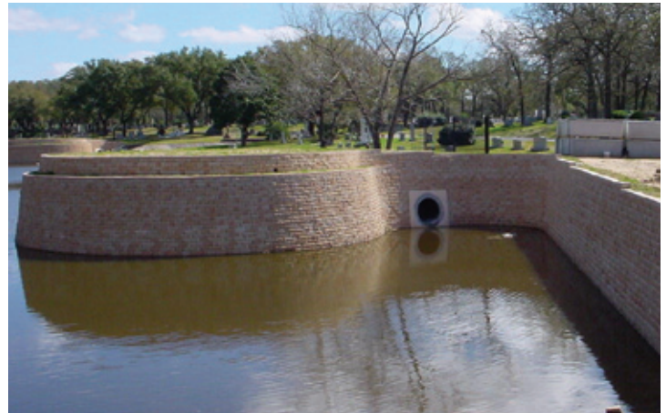
Outlet pipes were designed so the batter was the same as the wall.

Lake of the Woods in Forest Park Cemetery, is once again a serene area for contemplation. The warm look of the Highland Stone product helped maintain that tone. Construction caused minimal interruption at the cemetery, and the planned mausoleums will be a stately addition to the property.