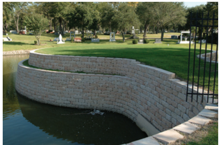
The contractor appreciated the ease of installation when the Highland Stone ® retaining wall system was used in the curved-peninsula applications.

© 2011 Anchor Wall Systems, Inc. The Highland Stone ® wall system is manufactured under license from Anchor Wall Systems, Inc. (AWS). The "Anchor A" and "Anchor Build Something Beautiful" logos and "Highland Stone" are trademarks of AWS. The wall system blocks are covered by the AWS Limited Warranty. For a complete copy, visit your local dealer or see anchorwall.com .