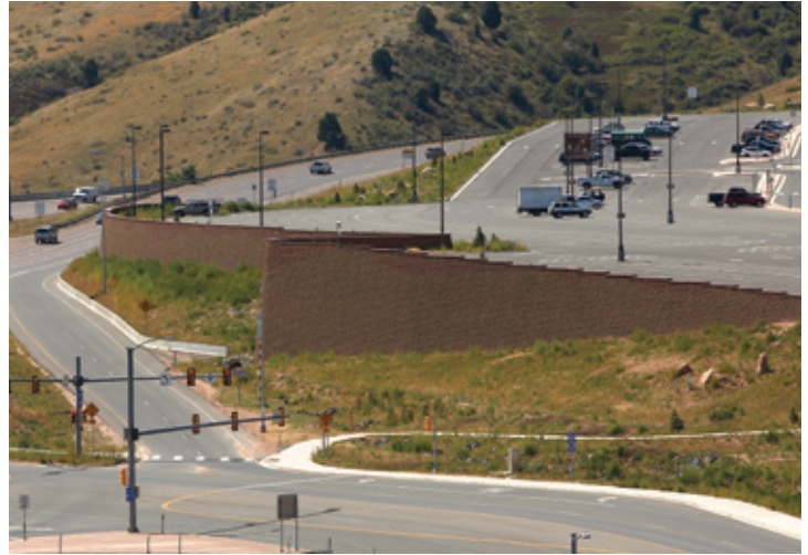
Busy exits off Interstate 70 were never closed during construction of the segmental retaining wall.

during construction so that contractors needed to be extra-vigilant about safety at all times. HTM Construction Company of Lakewood, Colorado, built the wall while navigating around the busy jobsite. They also needed to follow a specific installation pattern with the blocks in order to give a “wavelike” look to the wall with alternating colors. HTM Project Manager Wes Lundebey explains that the installation did not take longer than normal, due in part to the easy installation of the Diamond Pro Stone Cut product.