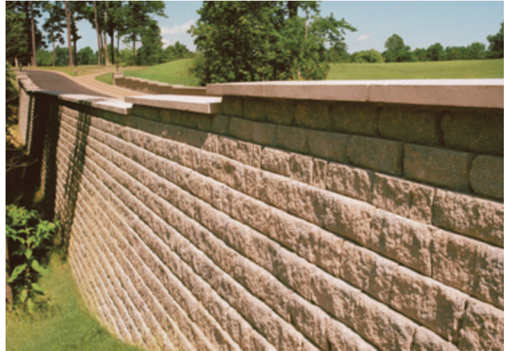
The land bridge utilizing Diamond Pro Stone Cut ® and Highland Stone ® retaining wall systems, combined with the load-transfer platform, offered 50 percent cost savings.