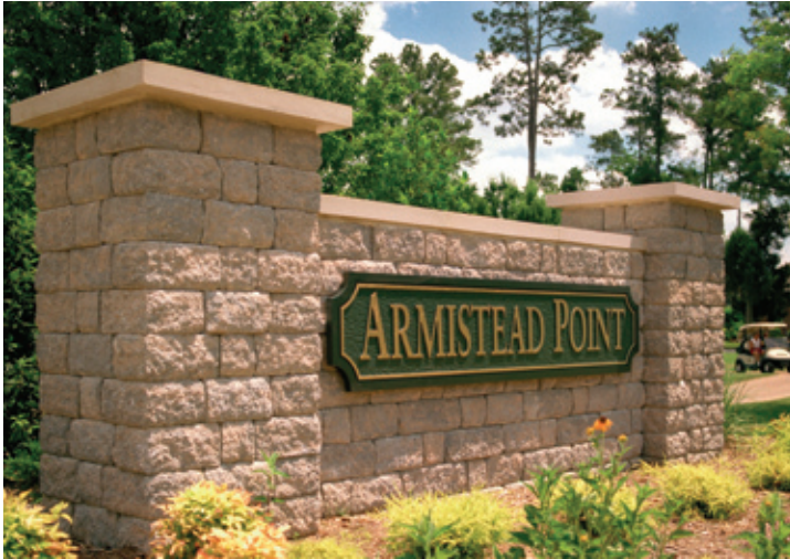
The blended, earth tone colors and unique, rustic appearance led to other applications on the project such as pillars and the entrance sign on the property.

transfer platform offered a 50-percent cost savings as compared to the proposed steel bridge. The blended, earth tone colors and unique, rustic appearance led to other applications on the project such as pillars and the entrance sign on the property. The Anchor ™ products provided proven structural performance while capturing the historic and natural beauty of Williamsburg.