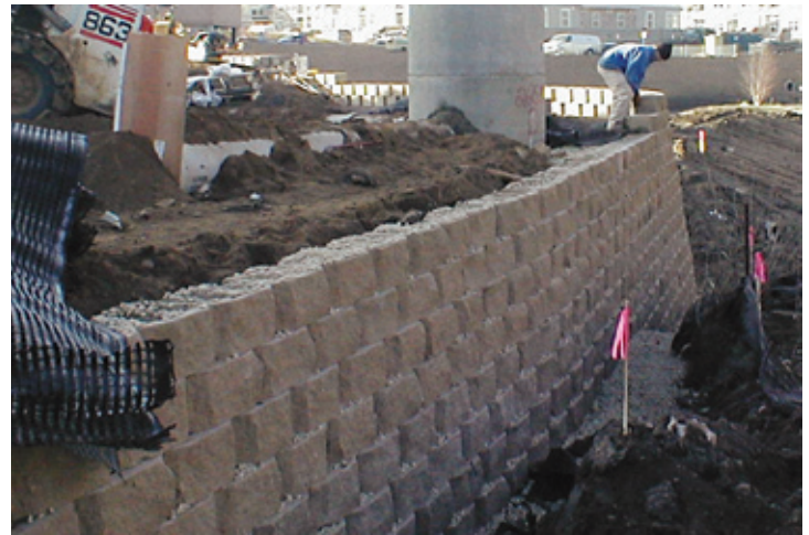
The Diamond Pro ® retaining wall system was constructed close to building foundations, utilities and drop structures, like this storm water drain.

© 2011 Anchor Wall Systems, Inc. The Diamond Pro ® wall system is manufactured under license from Anchor Wall Systems, Inc. (AWS). The "Anchor A" and "Anchor Build Something Beautiful" logos and "Diamond Pro" are trademarks of AWS. The wall system blocks are covered by the AWS Limited Warranty. For a complete copy, visit your local dealer or see anchorwall.com.