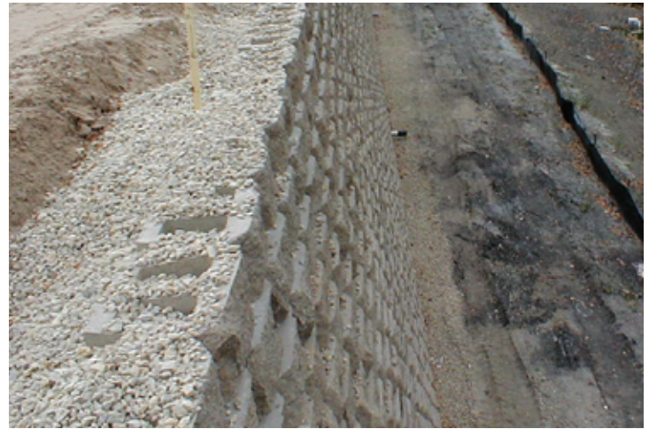
During Phase 2 of the project, the wall was constructed within 10 feet of a stream. Based on global-stability studies performed for the wall in the area near the stream, the wall designer compensated for the reduced strength of the submerged foundation soils.