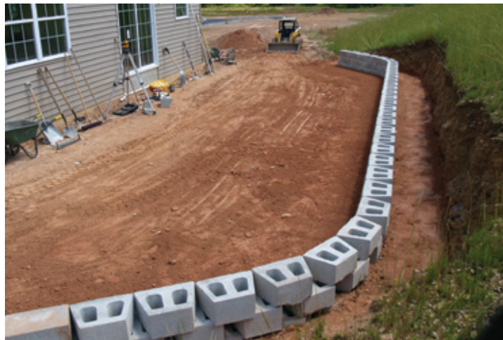
The house featuring the Anchorplex™ retaining wall system sold quickly because potential buyers saw an expanded, flat usable backyard.