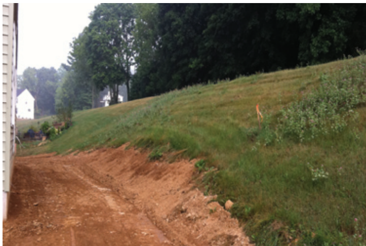
The backyard made this home a difficult sale. Prospective buyers found it too small and the grassy slope would be difficult to mow.