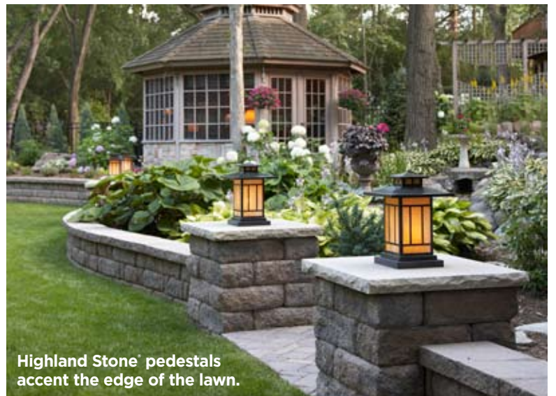
Highland Stone® pedestals accent the edge of the lawn.

While the former yard had some great features which were retained in the new landscape – a small pond, gazebo and flagstone pathways around garden beds – a prominent slope restricted its use. “The old backyard was a continuous slope from our lower patio to the property line. There was no grass, only moss,” the homeowner says. The existing perennial gardens and paths were difficult to maintain because of the slope. “I love to garden but wanted something easier to maintain,” she says.