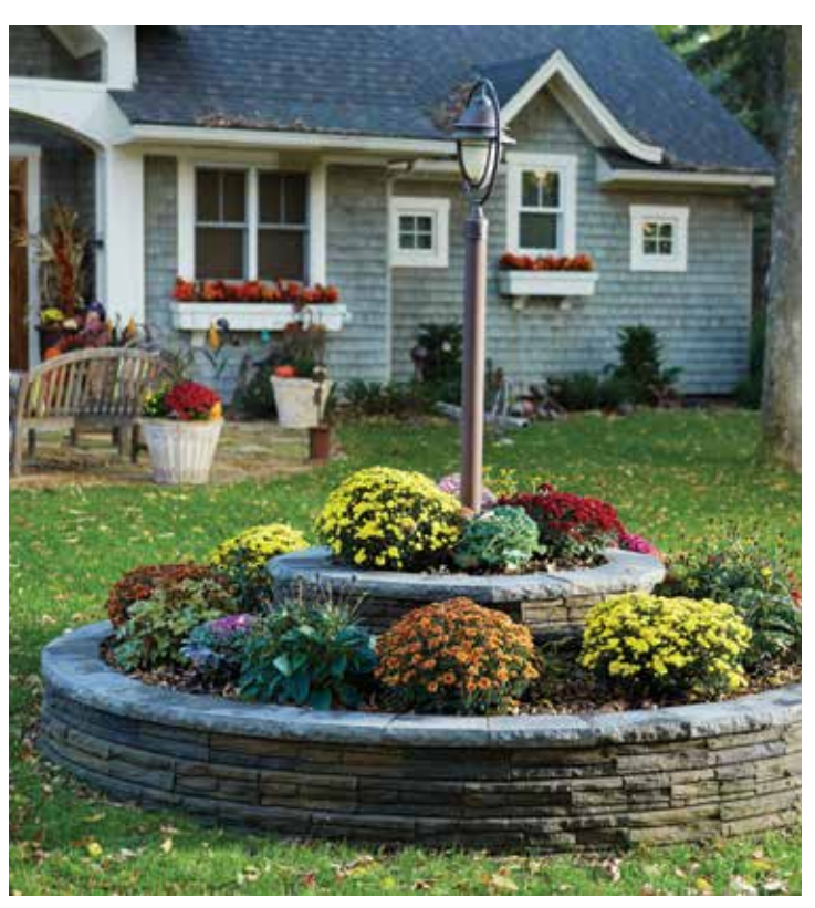
See anchordiamond.com for installation instructions.

** The full first course should be buried.