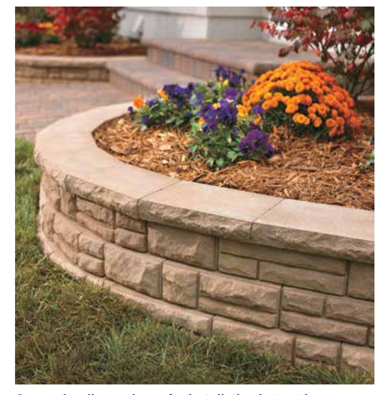
See anchordiamond.com for installation instructions.

The rear-lip block makes alignment easy. Just stack each block with the rear lip facing down on the course below and pull block forward until the lip touches the back of the lower block.