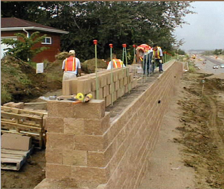
The geotechnical engineer specified gravel fill rather than concrete for this barrier wall made of back-to-back modular units so that it could be more easily repaired in the event of an accident.