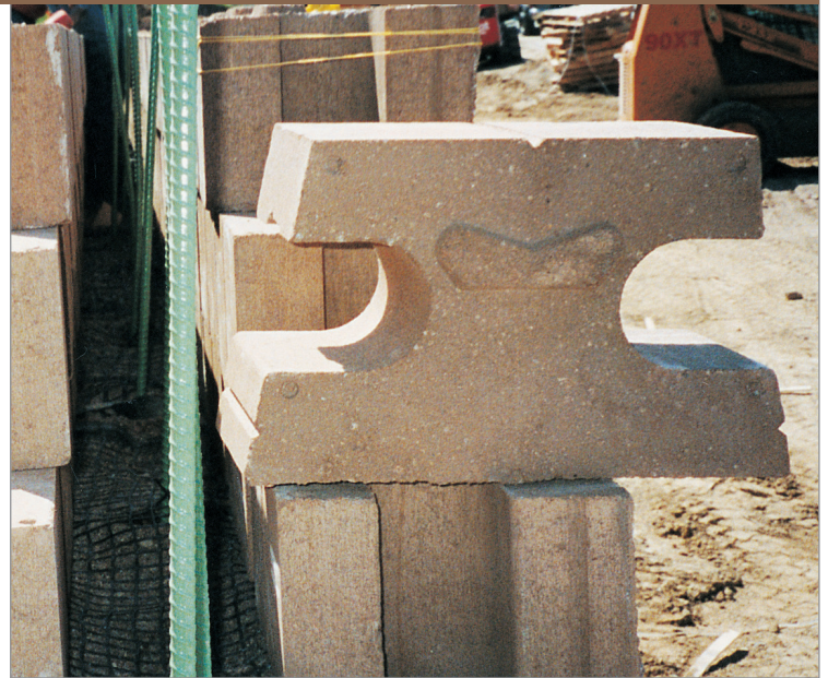
Vertica® retaining wall system blocks in the barrier wall were tied together with geogrid reinforcement.

By adding a band of slightly different colored block on portions of the retaining walls, the designer was able to meet neighborhood demands for a more aesthetically pleasing project. As for those business interruptions, using the Vertica®/Vertica Pro® blocks meant critical time savings. It was possible to complete a wall next to a bank drive-up lane over the weekend while the business was closed. An old wall went down Friday night, and the new wall went up on Saturday. According to the design engineer, a cast-in-place structure would have kept the lane closed for weeks, a situation that was unacceptable to the bank.