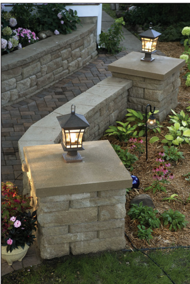
A Highland Stone® freestanding wall system with lighting provides a cozy seating area.

Updating the landscape of the home created an entirely new and welcoming look. The rich color and texture of Highland Stone products complement both the look of the home and the surrounding neighborhood, and give the yard the perfect blend of classic coziness and contemporary appeal.