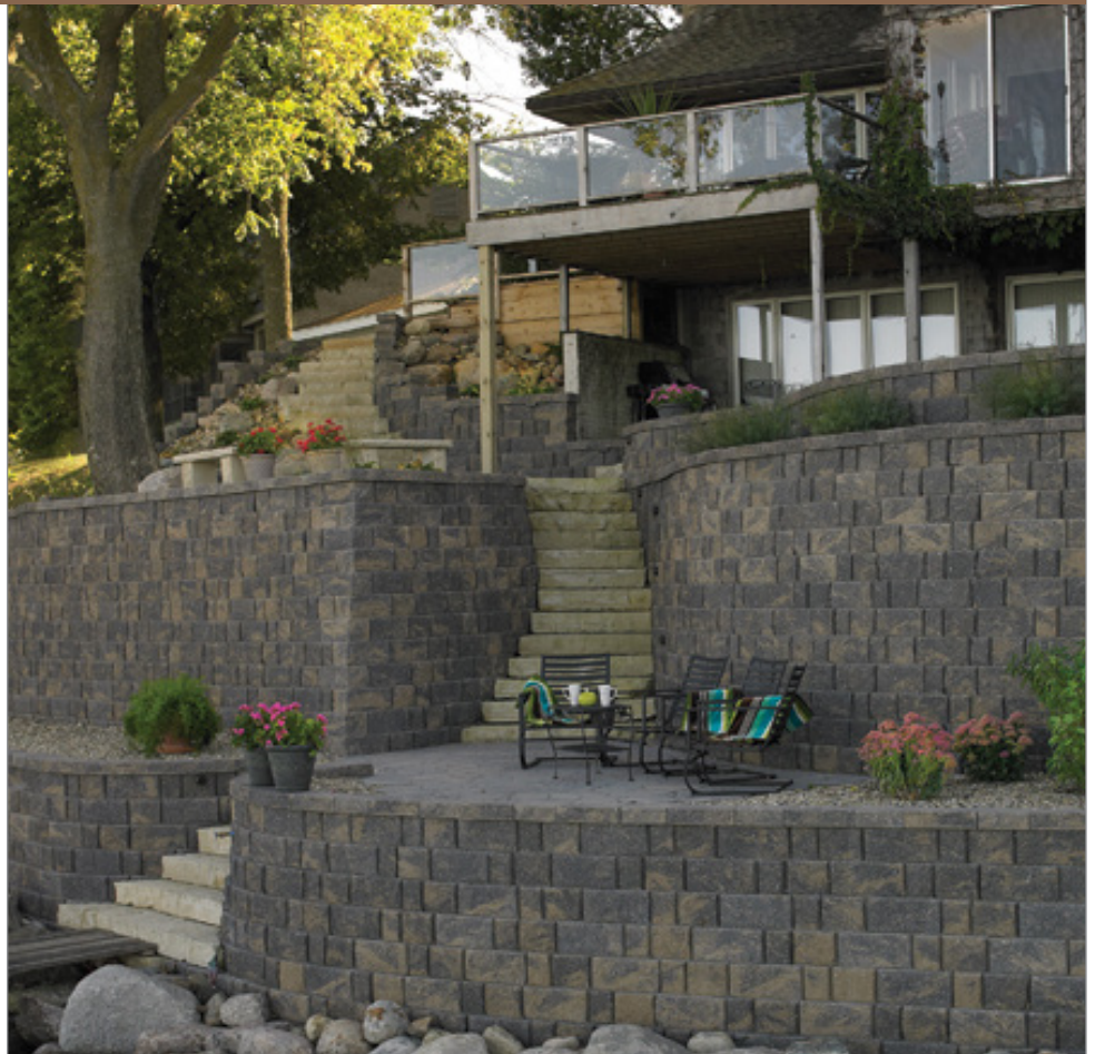
The transformation provides multiple spaces and includes lights lining the stairs, a fire pit and plenty of planting areas.