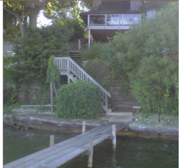
A rotting timber wall and slippery steps made access to the lake on the steep slope dangerous.

©2023 ANCHOR DIAMOND Group. All rights reserved. AD23-003 01/23